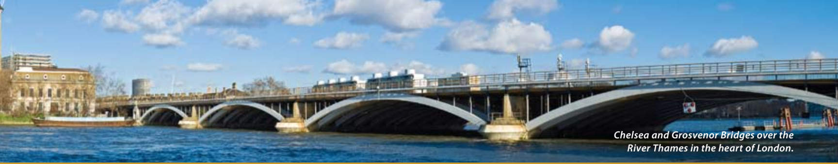
Chelsea and Grosvenor Bridges over the River Thames in the heart of London.