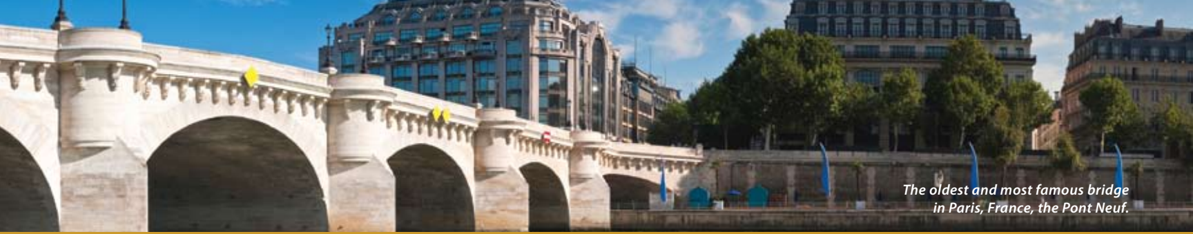
The oldest and most famous bridge in Paris, France, the Pont Neuf.

At Language Solutions, Inc. our passion is to open minds and shape perspectives of people and organizations as they create communications for their global audiences. We embrace a perspective that communication and translation have evolved from being a commodity into an asset for our clients.